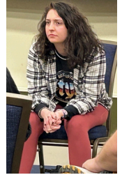
MAR 2024: (LEFT, BELOW) "SIMULATED PATIENTS" WITH COUNSELING & HELPING RELATIONSHIPS 1ST YEAR STUDENTS