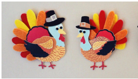
NOV 2023: (RIGHT) COHORTSGIVING, 2ND YEAR STUDENTS CELEBRATE WHILE ON CAMPUS FOR SATURDAY CLINICAL SKILLS LABS

This inspired another event for a larger audience! Q&A WITH ALUMNI , was a remote event held on April 4th. Alumni shared what they learned as Counselor Education students, how they've integrated that knowledge into their current roles, and words of wisdom for both new students beginning their studies, and students graduating soon and starting their journey to professional practice.