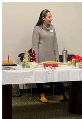
DEC 2023: WINTER HOLIDAY SOCIAL, CASUAL CONVERSATION AND SCRUMPTIOUS SNACKS