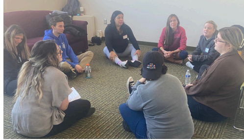
FEB 2024: (LEFT) "SIMULATED PATIENTS" JOIN SC ADVANCED GROUP THERAPY. MAR 2024: (BELOW) CMHC GROUP THERAPY