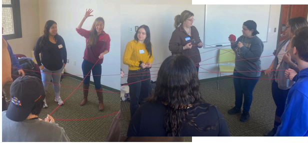
FEB 2024: (ABOVE) 2ND YEAR SC STUDENTS MAKING CONNECTIONS AT CLINICAL SKILLS LABS