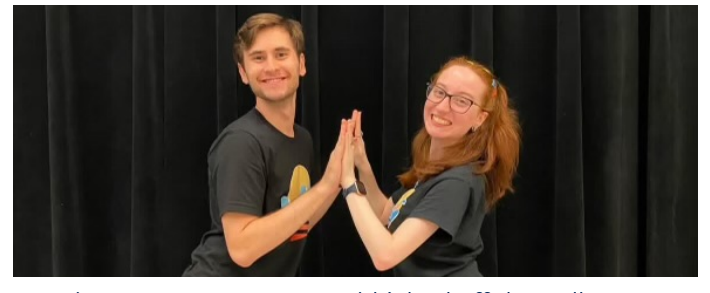
WIG (Western Improv Group) kicked off the Fall season with their "ThanksWIGing" event, delivering an excellent improv show that brought plenty of laughs and entertainment to the WCSU community.