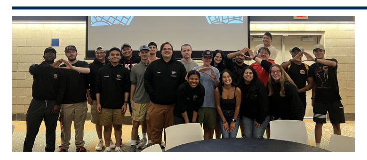
TKE (Tau Kappa Epsilon) and PAC (Program Activities Council) hosted a lively bingo night on campus, offering students a fun chance to relax, socialize, and win prizes.