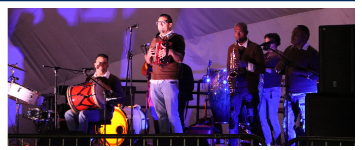
SGA (Student Government Association), WCSU Beyond Borders, and LASO (Latin American Student Organizations) hosted a vibrant Latin Block Party celebrating Latinx culture. The event featured music, dancing, and delicious food, fostering unity and appreciation for diversity at WCSU.