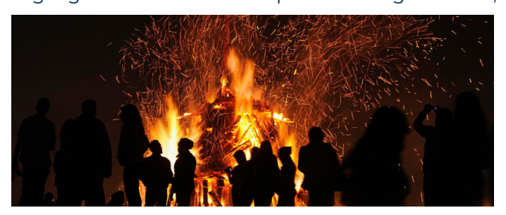
The Welcome Back Bonfire, hosted by ACSA (African Caribbean Student Association) and BSU (Black Student Union). Students packed the Science Lawn to watch a movie, eat s'mores, and ring in the new school year with this movie night!

Highlights of events on campus including activities, student involvement, and of campus life.