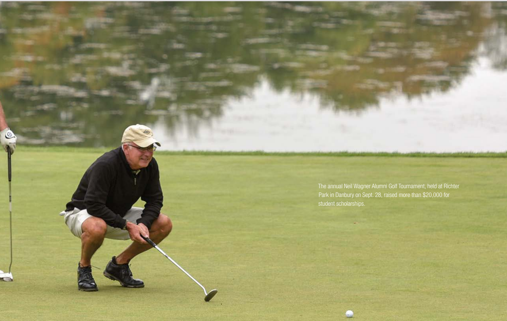
The annual Neil Wagner Alumni Golf Tournament, held at Richter Park in Danbury on Sept. 28, raised more than $20,000 for student scholarships.