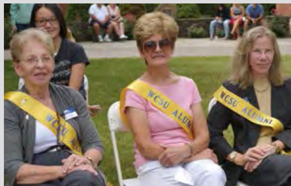
WCSU alumni supporting the university.