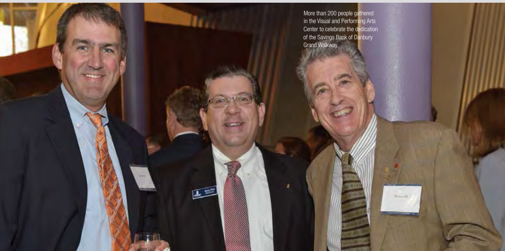
More than 200 people gathered in the Visual and Performing Arts Center to celebrate the dedication of the Savings Bank of Danbury Grand Walkway.