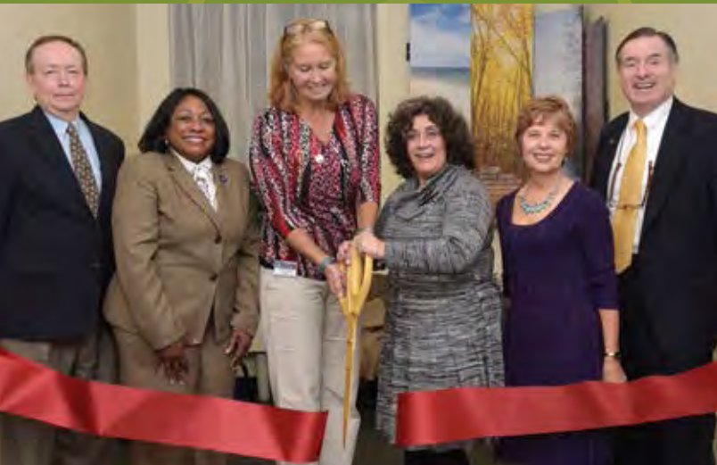
The new Wellness and Holistic Center opened its doors in November.