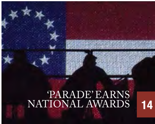
'PARADE' EARNS NATIONAL AWARDS