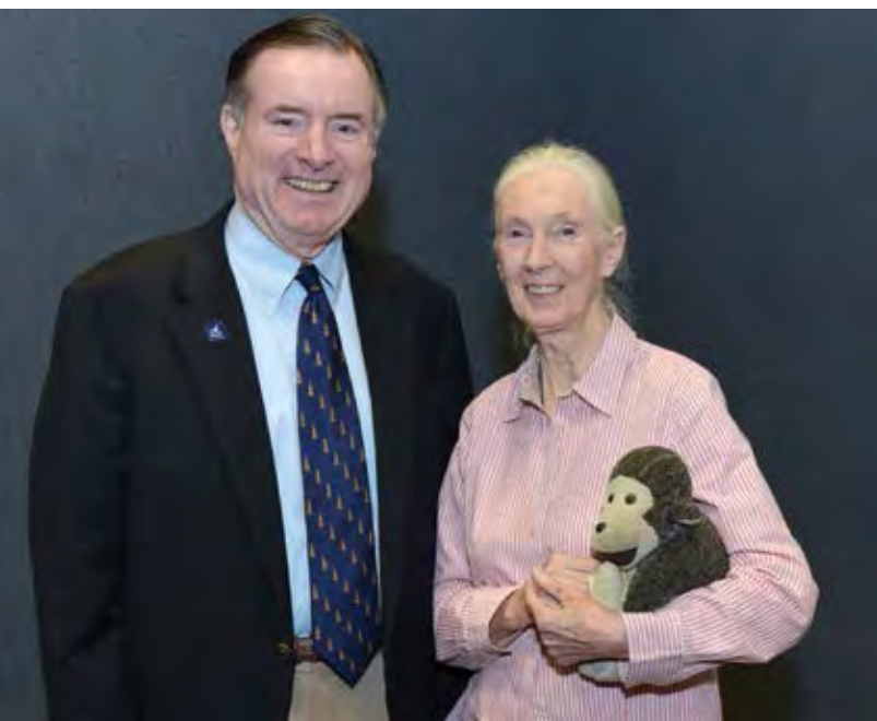
Below: Dr. Jane Goodall delivered a lecture and dedicated the university's new permaculture garden.