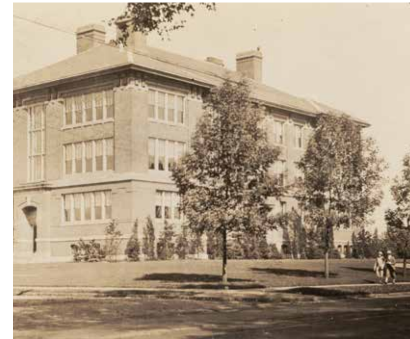
The Danbury Normal School, circa 1910. Now known as Old Main, it is the birthplace of Western Connecticut State University.

The evolution of a modest Danbury teachers school into a full-fledged university with many undergraduate and graduate degree programs reached its culmination with the renaming of the institution in 1983 as Western Connecticut State University, one