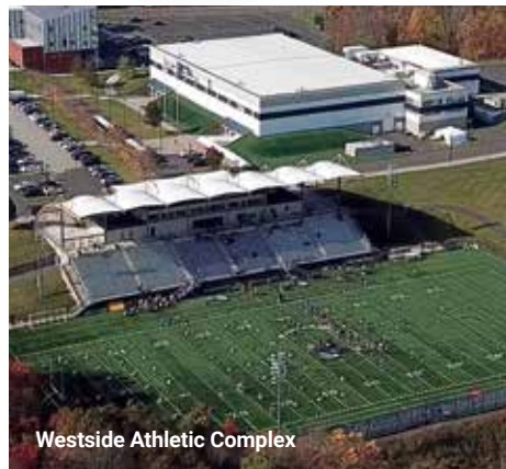
Westside Athletic Complex