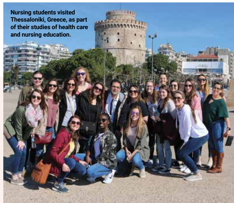
Nursing students visited Thessaloniki, Greece, as part of their studies of health care and nursing education.