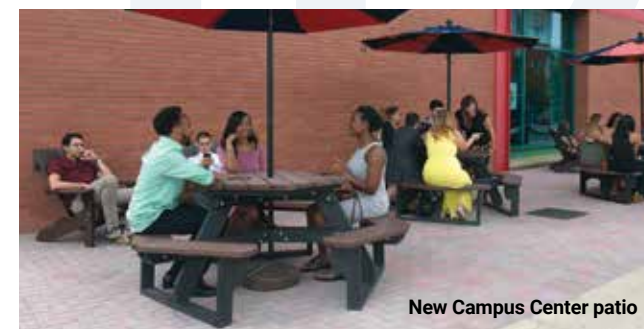
New Campus Center patio

The Westside Campus Center has benefited from many improvements. An outdoor patio facing the VPA building has been completed where students and staff can enjoy outdoor dining or lounging with picnic tables, umbrellas and Adirondack chairs. Also a new technology resource center has been created in the space previously used as a cardio fitness center.