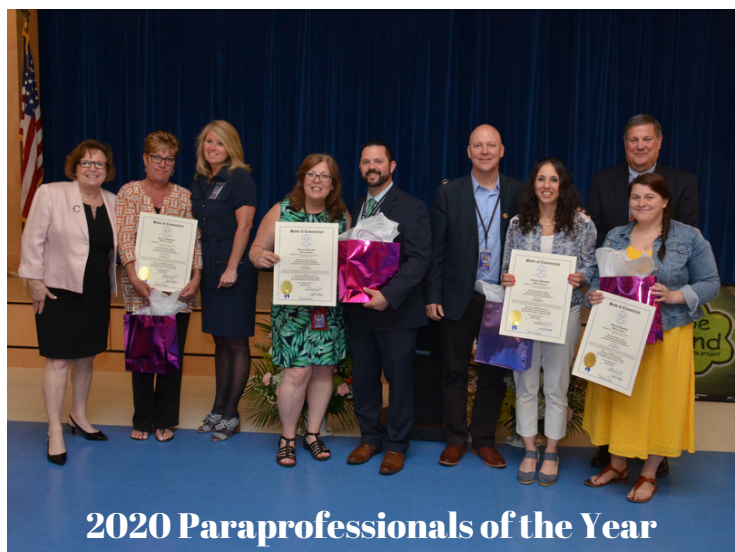
2020 Paraprofessionals of the Year