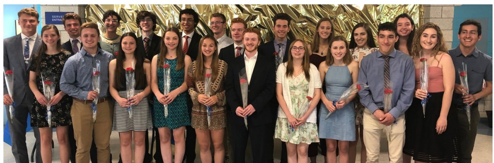
Congratulations to the top 10% of the NFHS Class of 2019!