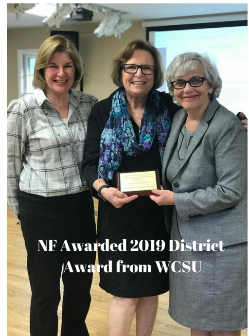
NF Awarded 2019 District Award from WCSU