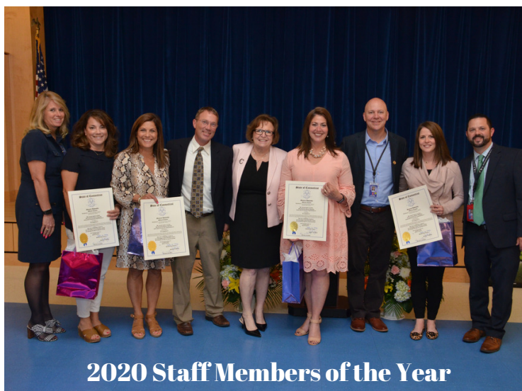
2020 Staff Members of the Year