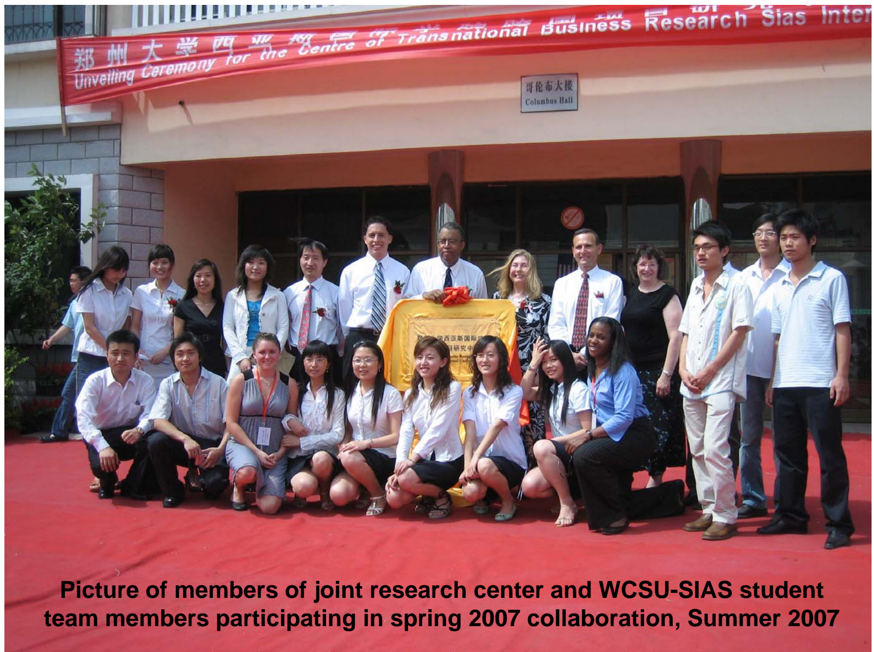
Picture of members of joint research center and WCSU-SIAS student team members participating in spring 2007 collaboration, Summer 2007