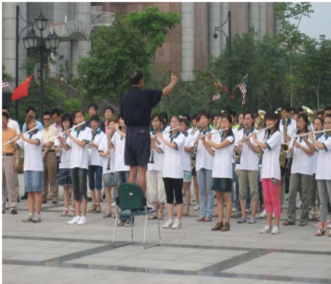
SIAS Band Leading Off Welcoming Ceremony for WCSU Delegation