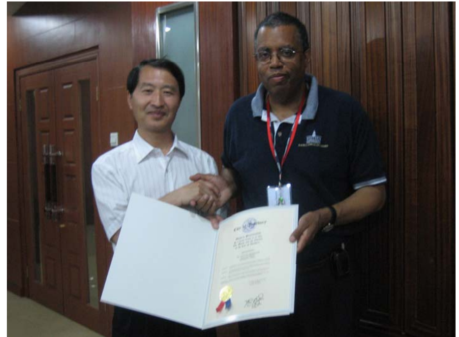
Official Signing of Documents Joining the Two Research Centers