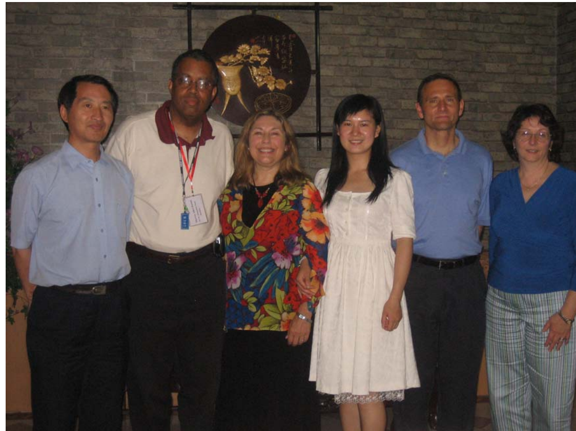
The Joint Research Centers: WCSU & SIAS Personnel