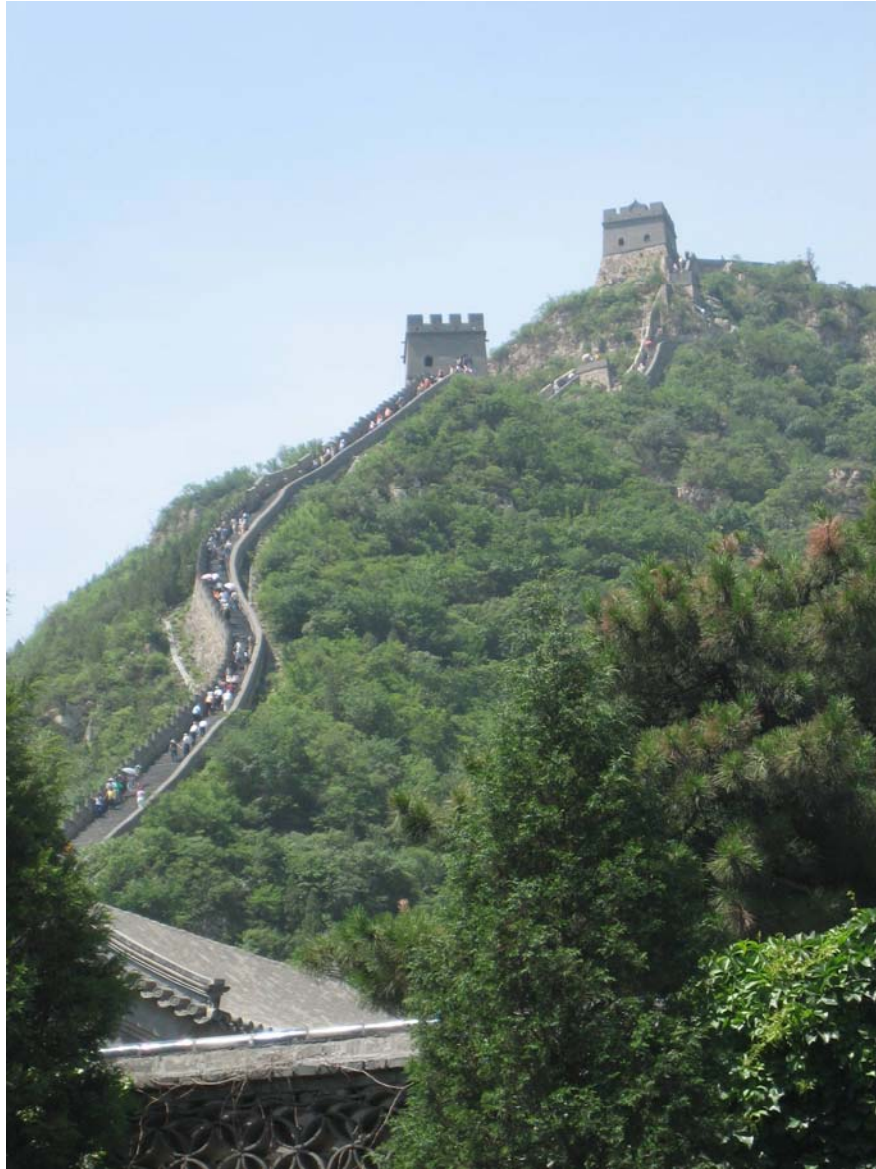
Two of the Many Highlights of Summer 2007 Trip: The Great Wall and The Forbidden City