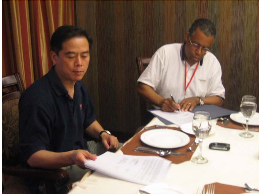
Summer 2007 China Trip